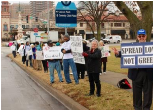
Kansas City, MO