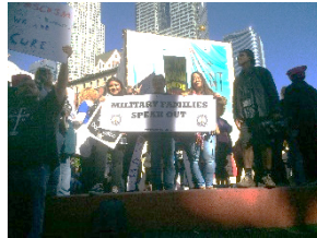
Los Angeles, CA