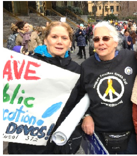
New York City, NY